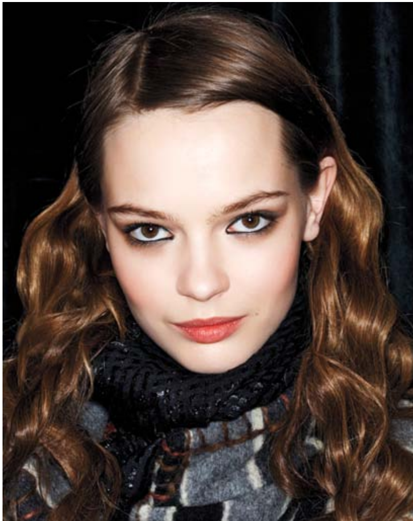
image: model at Anna Sui, Fall 2009

One look getting lots of attention for Fall is that of wavy, natural curls. Low Waves , as they've been called, were seen at Anna Sui, Proenza Schouler, Salvatore Ferragamo, and Tracy Reese Fall 2009 runway shows.